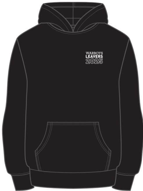
Artwork W: 70mm