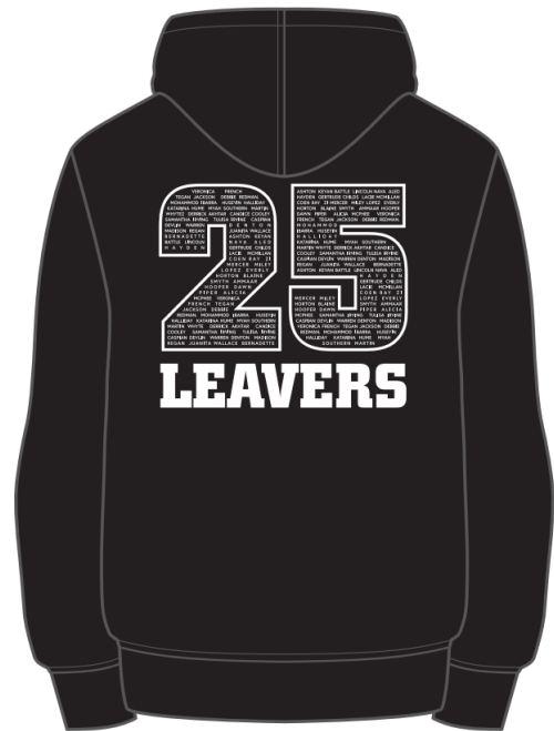
Artwork W: 270mm

On the rear of the hoodies, their first names can be printed. You can choose not to have the first name printed if you wish.